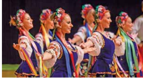
the Arctic snows to the sands of Tajikistan, the Chorus left Soviet soil to sing at an International Exposition held in 1937 in Paris where it

Having performed throughout the Soviet Union, from